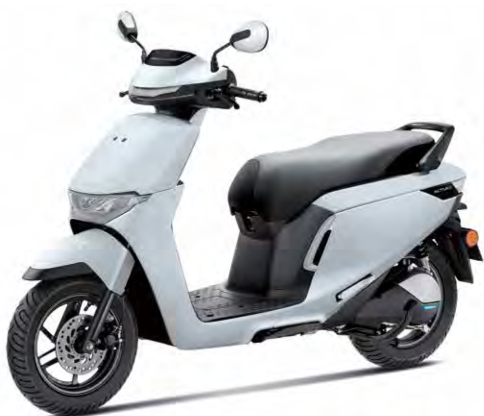
Pearl Misty White

*Products shown in the pictures may vary from actual products available in the market. All features and colours may not be part of all variants. Accessories shown in the pictures are not part of standard equipment. For creative visualisation only.